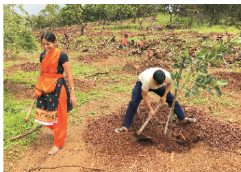
14th July, 2019 - 30 volunteers planted 80 trees