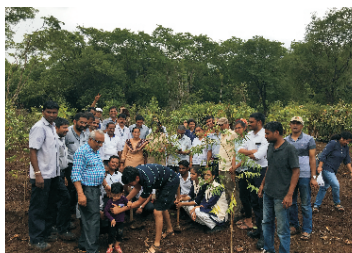
20th July, 2019 - 45 volunteers planted 100 trees