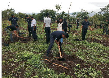
26th July, 2019 - 30 volunteers planted 60 trees