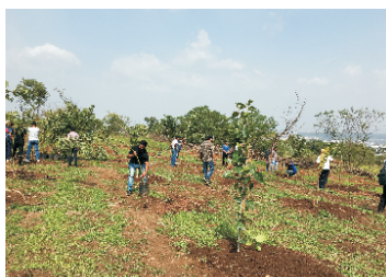
19th July, 2019 - 300 volunteers planted 500 trees