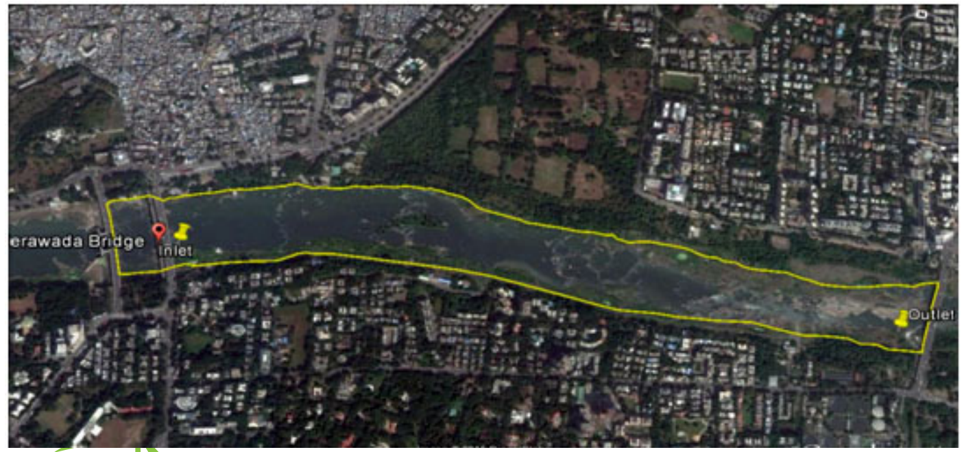
Figure – 1: Google Earth image showing the study area from Yerwada bridge to Kalyani nagar bridge

INKING INNOVATIONS ISBN : 978-93-85311-04- 8