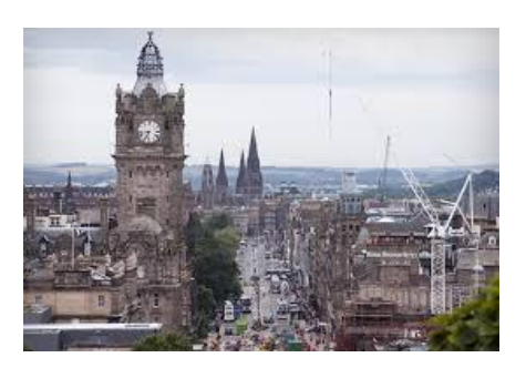
Bells towers and roofs in Edimburg (Scottland). A university quality life.