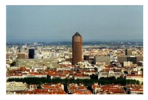
"Le crayon" : "The pen" in Lyon (France). Gives the vitality to the district.

In other words, in order to develop intelligence, the presence of a head (top of a building) is necessary. If there no visible roof, this means that the house has no "head" (no brain, no intelligence): in an Earth energy environment (horizontal or vertical rectangular shapes), if there is no roof edge, intelligence will not be favored. Indeed, for the Chinese, the tip of a rectangle symbolizes a pencil, so that the mind is used.